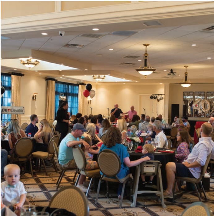
DC Elevator 40th Anniversary Company Party