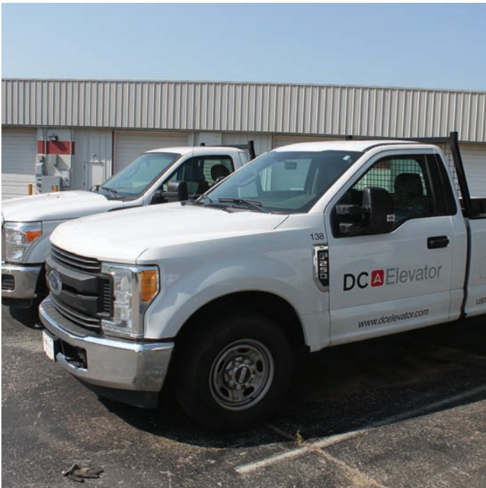
DC Elevator Trucks - Always on the Road for You