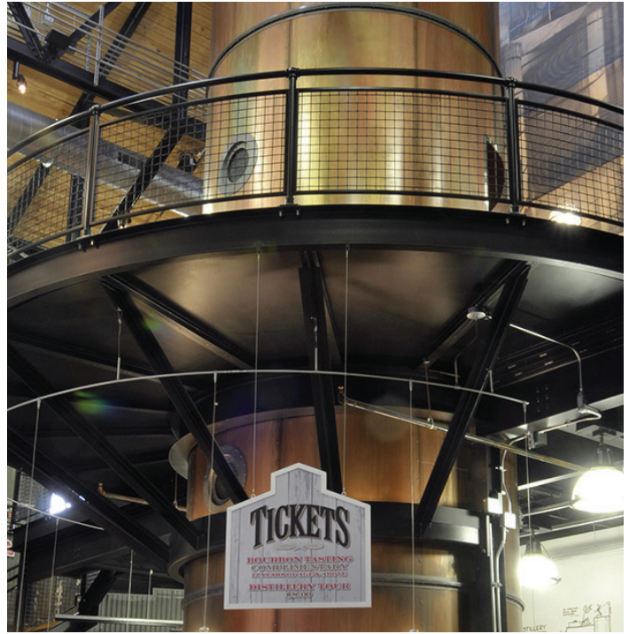
"Stillevator" at the Jim Beam® American Stillhouse