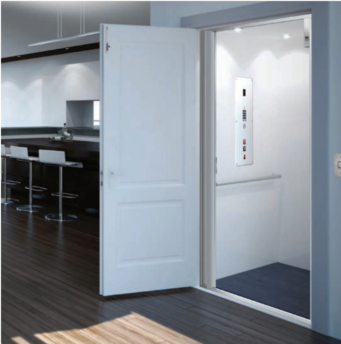
Residential Elevator in Kitchen Environment