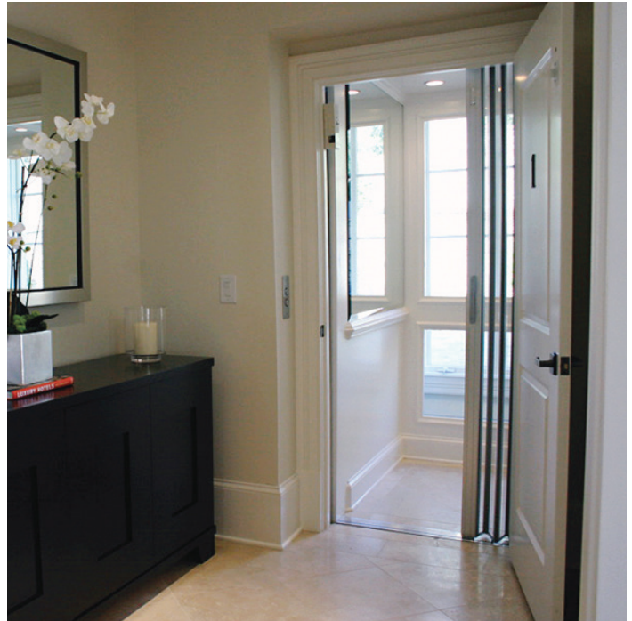
Residential Elevator with Glass Option

Project Management Hotline +1-859-254-8224