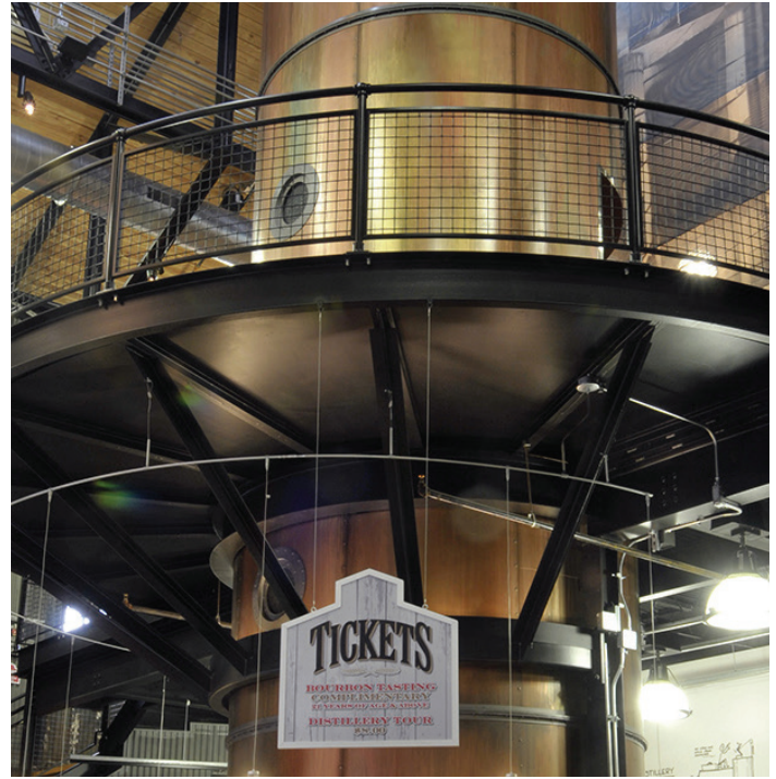
"Stillevator" at the Jim Beam® American Stillhouse