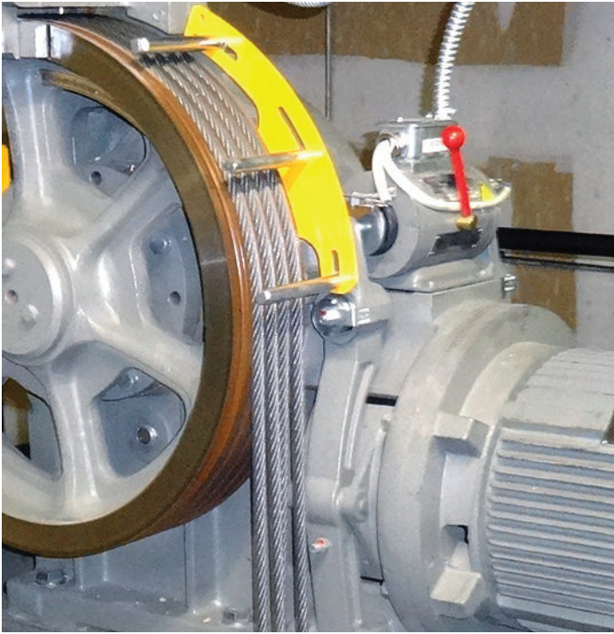
Modern Traction Elevator Motor