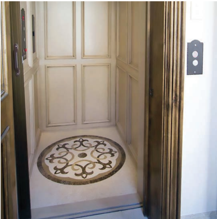
Residential Flooring Upgrade to Complement Home's Decor