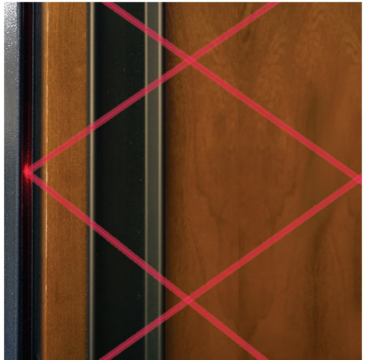
Light Curtain Adds an Additional Level of Safety